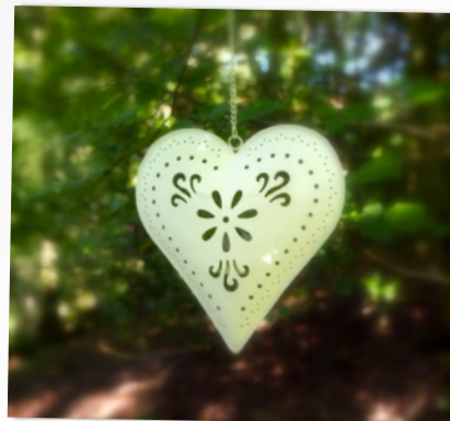
HEART IN WOODS