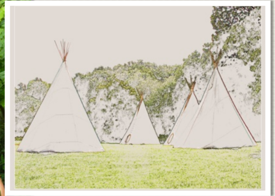
A SCOUT CAMP THE PERFECT PLACE TO "TIE THE KNOT"